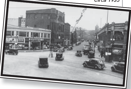
continued page 2