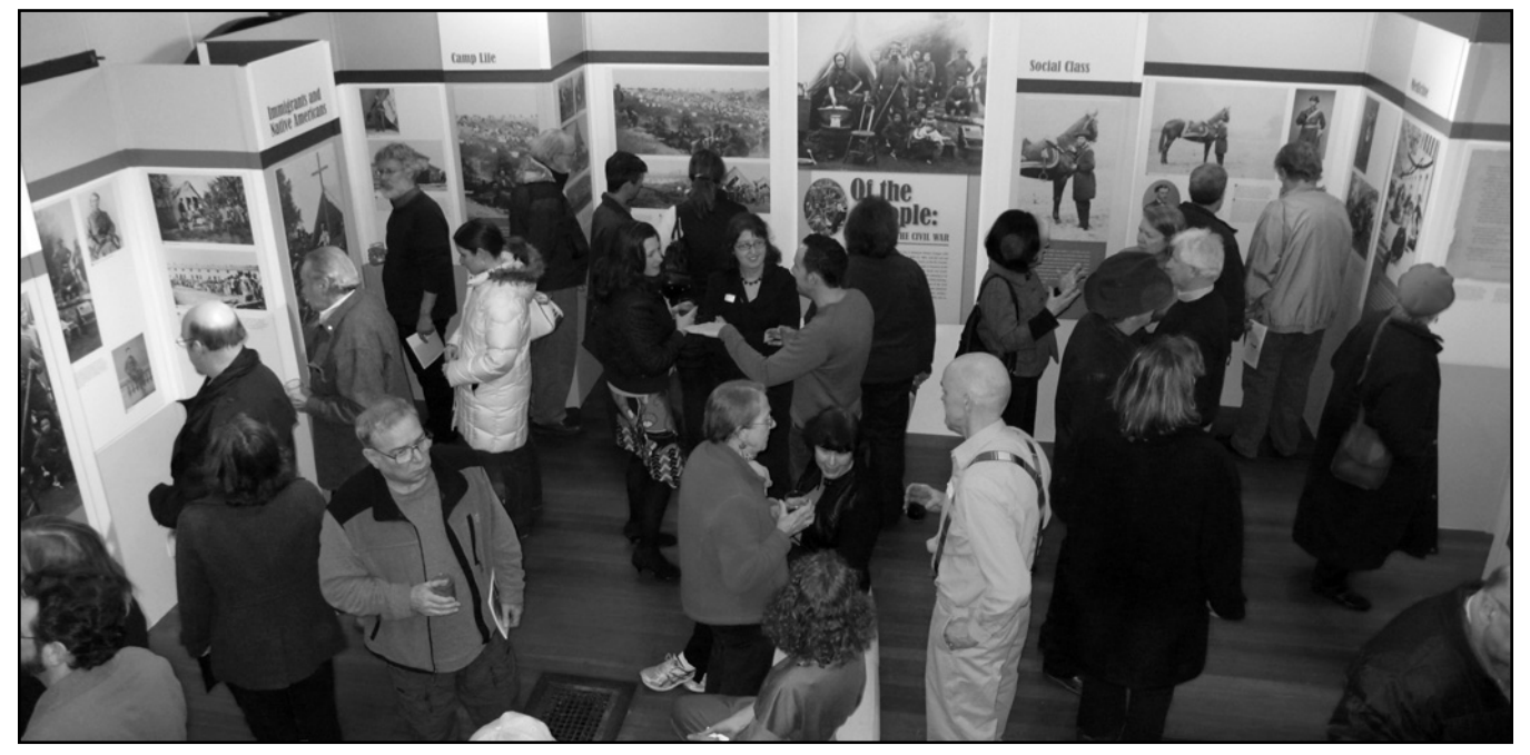
BELOW: Attendees at Opening Night got their first preview of the show.