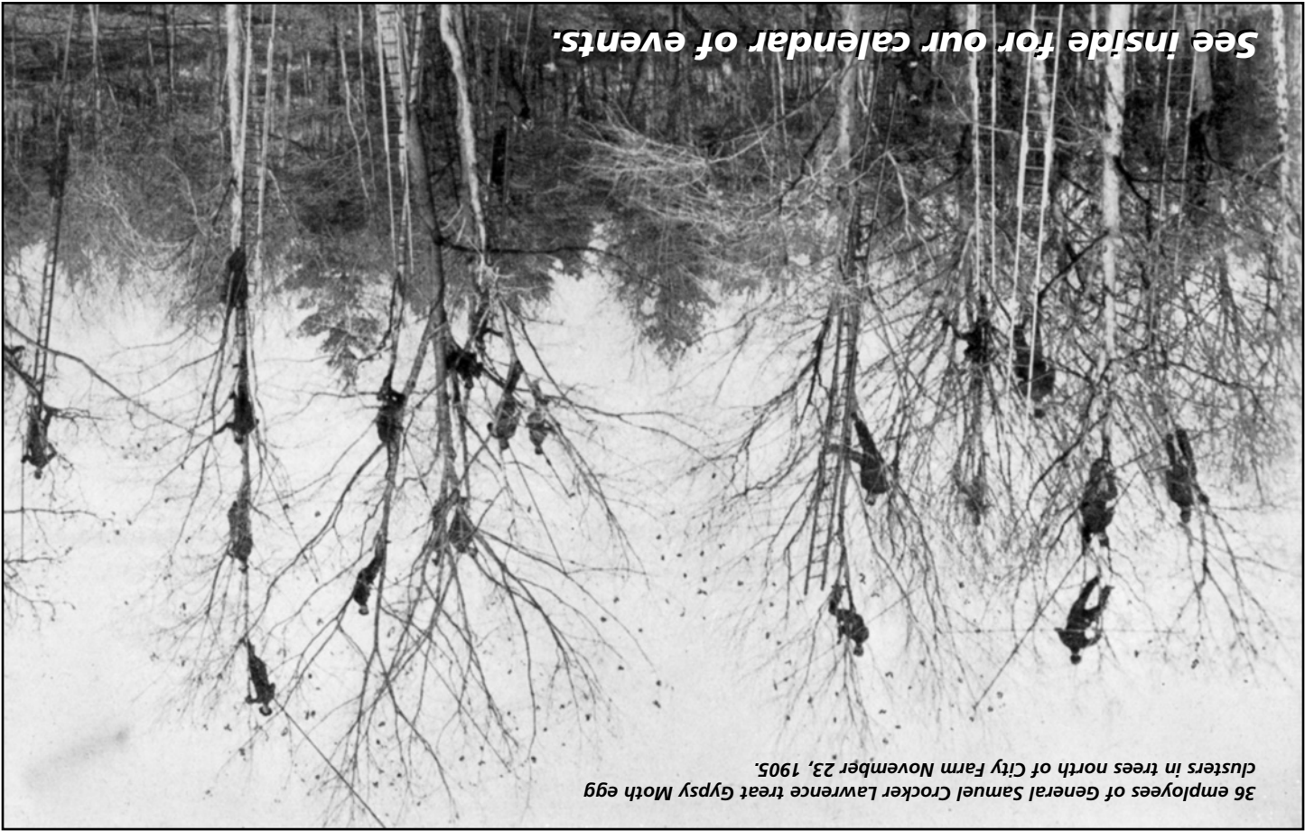
36 employees of General Samuel Crocker Lawrence treat Gypsy Moth egg clusters in trees north of City Farm November 23, 1905.