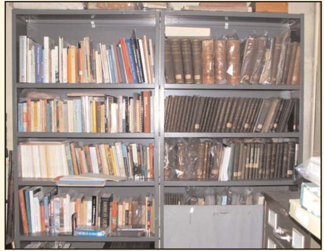
These pictures show the research area before recent organization (LEFT) and after (RIGHT).