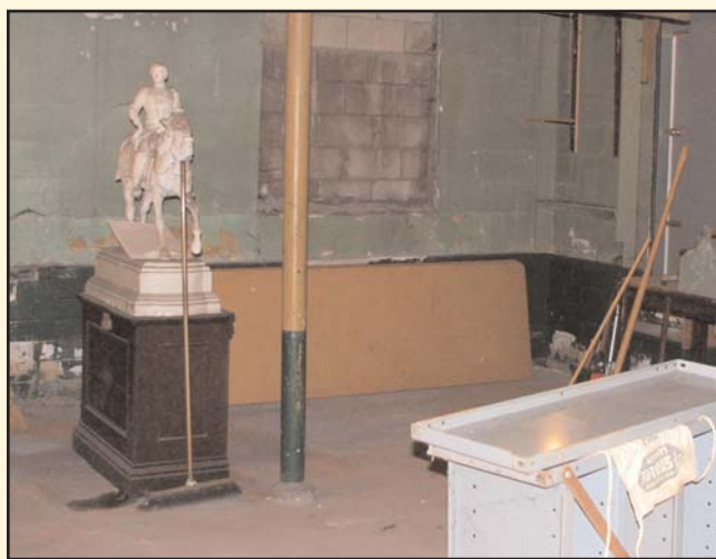
These pictures show the basement area before recent clean-out (TOP) and after (ABOVE). We discovered artifacts and papers which are part of the collection as well as lots of trash.